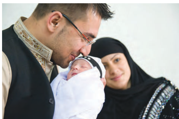
Middle right: A father meets his newborn baby girl at Afshar Hospital in southern Kabul, Afghanistan, which receives donated medicines and supplies from AmeriCares