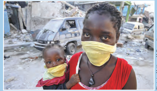
AmeriCares emergency pharmacy allows us to respond quickly to disasters