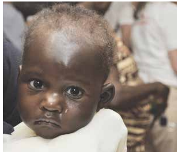
This malnourished child just arrived at a home for orphans.

What's growing here — knowledge and healthy children — will benefit generations to come.