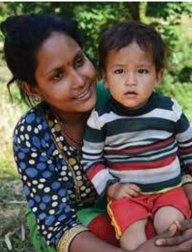
In Nepal, this mother and child had access to medicine after the earthquake because of AmeriCares disaster readiness.

Over the years, Medtronic has donated more than $78 million in medical products to AmeriCares.