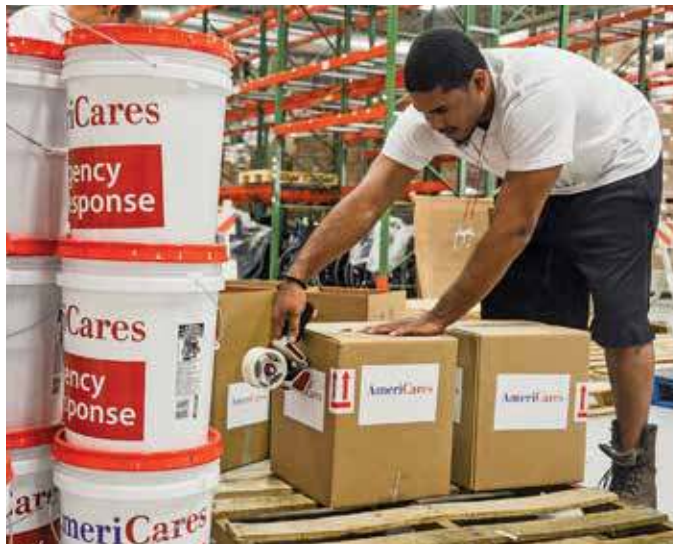
Buckets of relief and cleaning supplies went to flood victims in Illinois and Missouri.