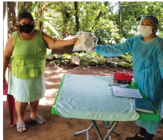
No community is too far for AmeriCares community health workers in El Salvador.

In the first 60 days of the project, 14,000 patients underwent triage and consultation at the clinic, more than 11,000 patients received COVID-19