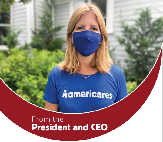
From the President and CEO