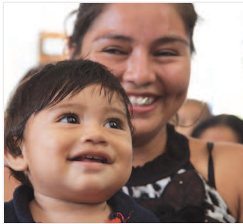
Américas clinic in rural El Salvador provides quality health care—including well-baby care—to some of the region's poorest residents.

Headquartered in Japan, Astellas is a research-based global pharmaceutical company committed to advancing innovative medical solutions for patients, particularly in key focus areas, including