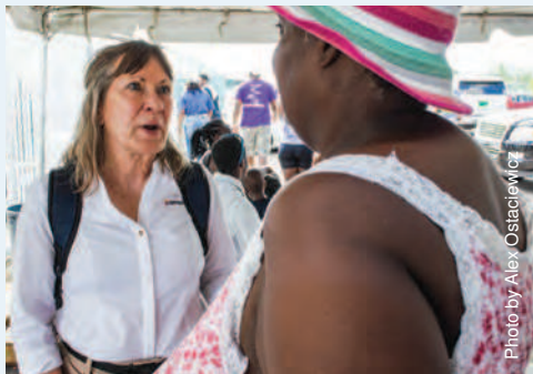
Américas mental health and psychosocial counselors helped hurricane survivors deal with trauma and loss.

The Américas counselor sat with the boy and offered support. "How can we work together to find some relief for you?" the counselor asked.