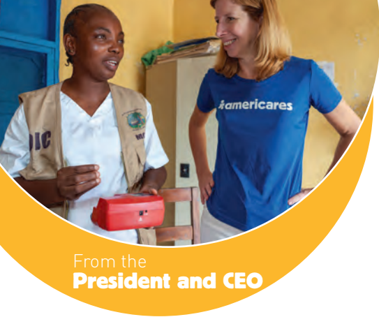
From the President and CEO