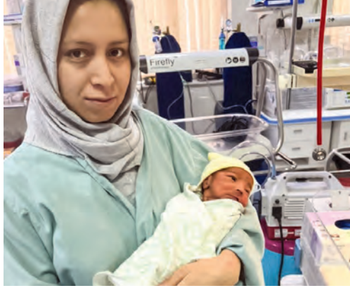
A dose of medicine from AmeriCares saved this newborn's life.