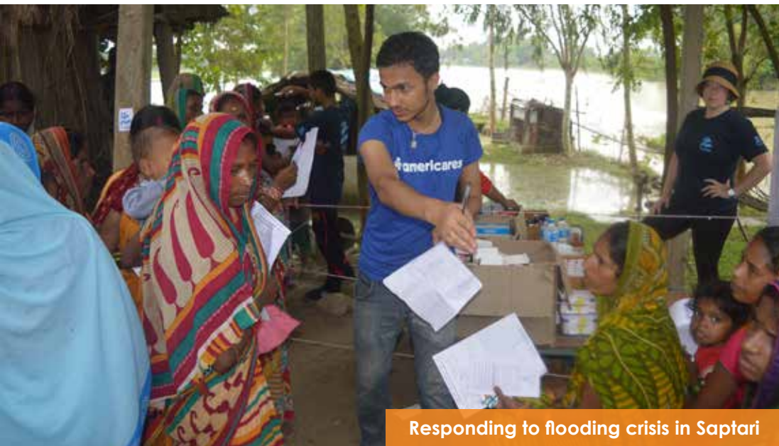
Responding to flooding crisis in Saptari

Americares responded to the severe flooding of August 2017 in the Terai belt (southern plains) of Nepal that affected more than six million people. Responding to this emergency, Americares transported medicines and medical supplies to 10 districts of Nepal. Americares also donated medicines worth USD 5,000 to the District Health Office, Saptari and additional medicines worth USD 10,000 in coordination with Fairmed, to the Department of Health Services in Kathmandu. Additionally, in partnership with IsraAID, Americares organized five mobile camps in the flood affected district of Saptari where more than 1,700 patients were treated. These camps were organized in close coordination with the District Health Office, Saptari and the treatment services were provided on MHPSS and general health checkup. Together with treatment services, 600 hygiene kits were distributed to the affected families.