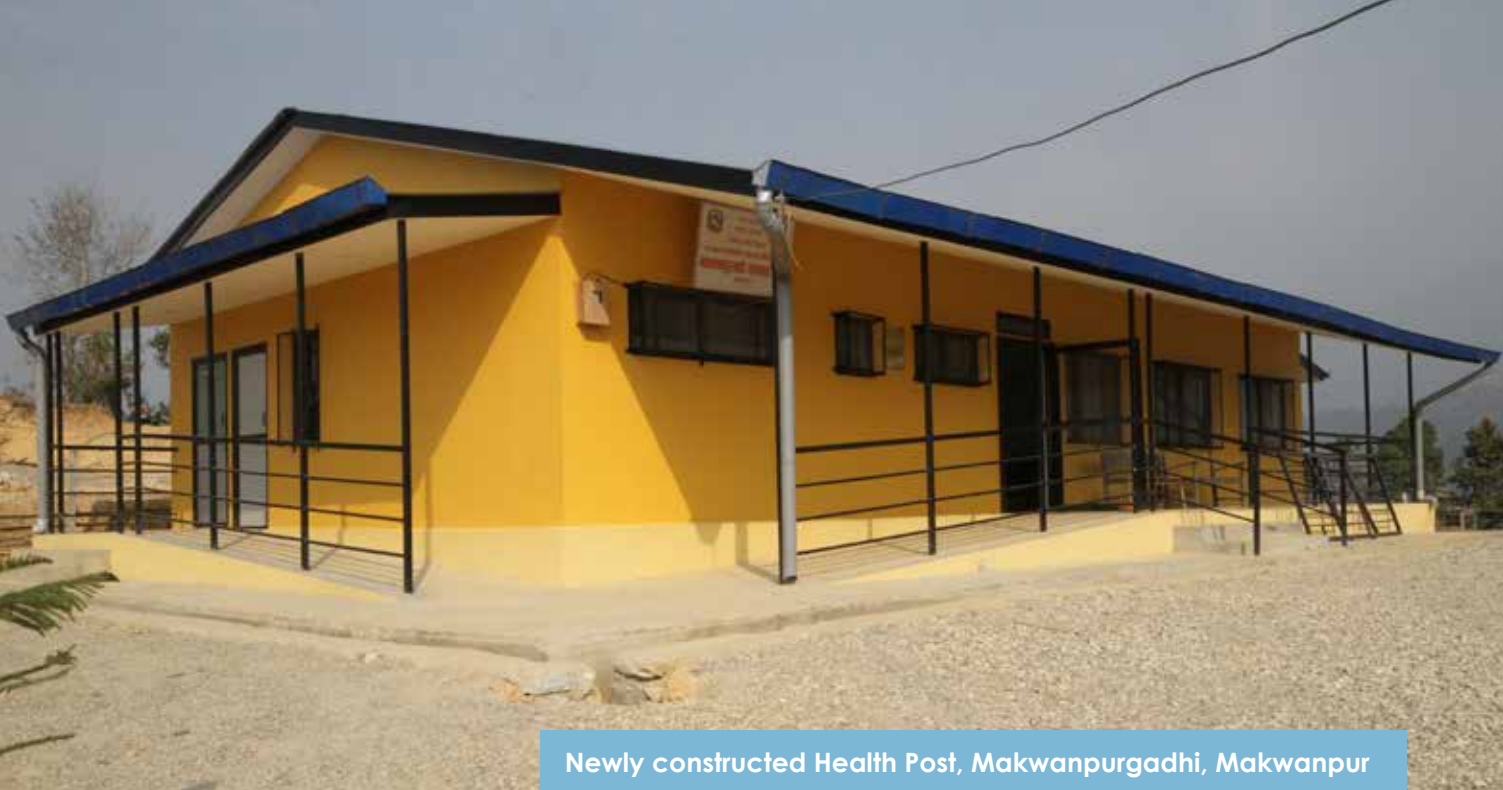
Newly constructed Health Post, Makwanpurgadhi, Makwanpur