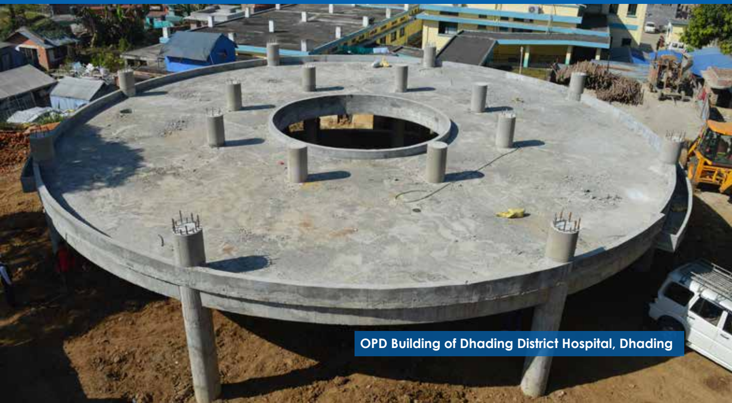
OPD Building of Dhading District Hospital, Dhading

- Kamaya Tamang, Lingjo, Ward-9, Tipling