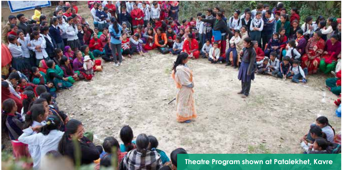
Theatre Program shown at Patalekhet, Kavre

This project was designed to provide psychosocial support to remote and isolated earthquake-affected communities. Across six districts, Americares and our partners are promoting community resilience by helping survivors develop long-term coping strategies, regain a sense of normalcy and fully recover. In the first phase of the project, by training Female Community Health Volunteers and Auxiliary Nursing Midwives (ANMs) and raising community awareness through theater forums, the project helped to create an effective community-led mechanism for psychosocial support at the grassroots level.