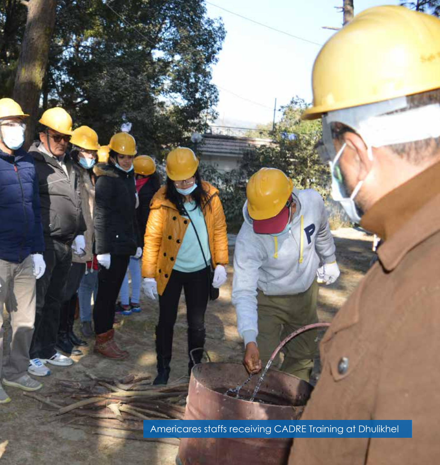
Americares staffs receiving CADRE Training at Dhulikhel