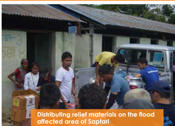
Distributing relief materials on the flood affected area of Saptari

Americares responded to the severe flooding of August 2017 in the Terai belt (southern plains) of Nepal that affected more than six million people. Responding to this emergency, Americares transported medicines and medical supplies to 10 districts of Nepal. Americares also donated medicines worth USD 5,000 to the District Health Office, Saptari and additional medicines worth USD 10,000 in coordination with Fairmed, to the Department of Health Services in Kathmandu. Additionally, in partnership with IsraAID, Americares organized five mobile camps in the flood affected district of Saptari where more than 1,700 patients were treated. These camps were organized in close coordination with the District Health Office, Saptari and the treatment services were provided on MHPSS and general health checkup. Together with treatment services, 600 hygiene kits were distributed to the affected families.