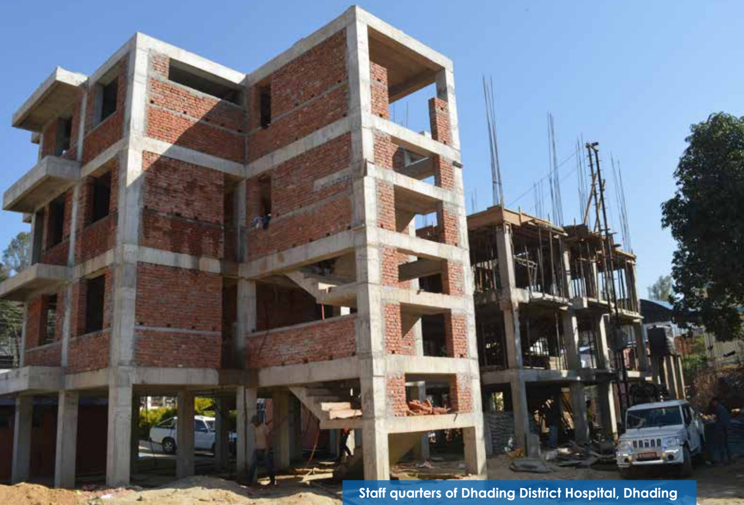
Staff quarters of Dhading District Hospital, Dhading