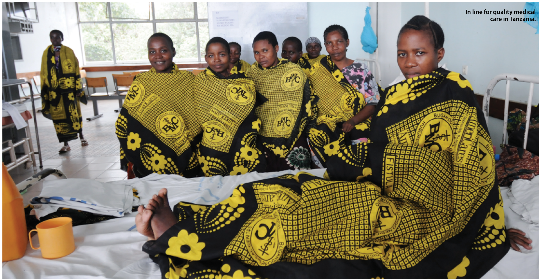
In line for quality medical care in Tanzania.

PROJECTS TO IMPROVE HEALTH OUTCOMES FOR 24,000 WOMEN AND CHILDREN IN 8 COUNTRIES