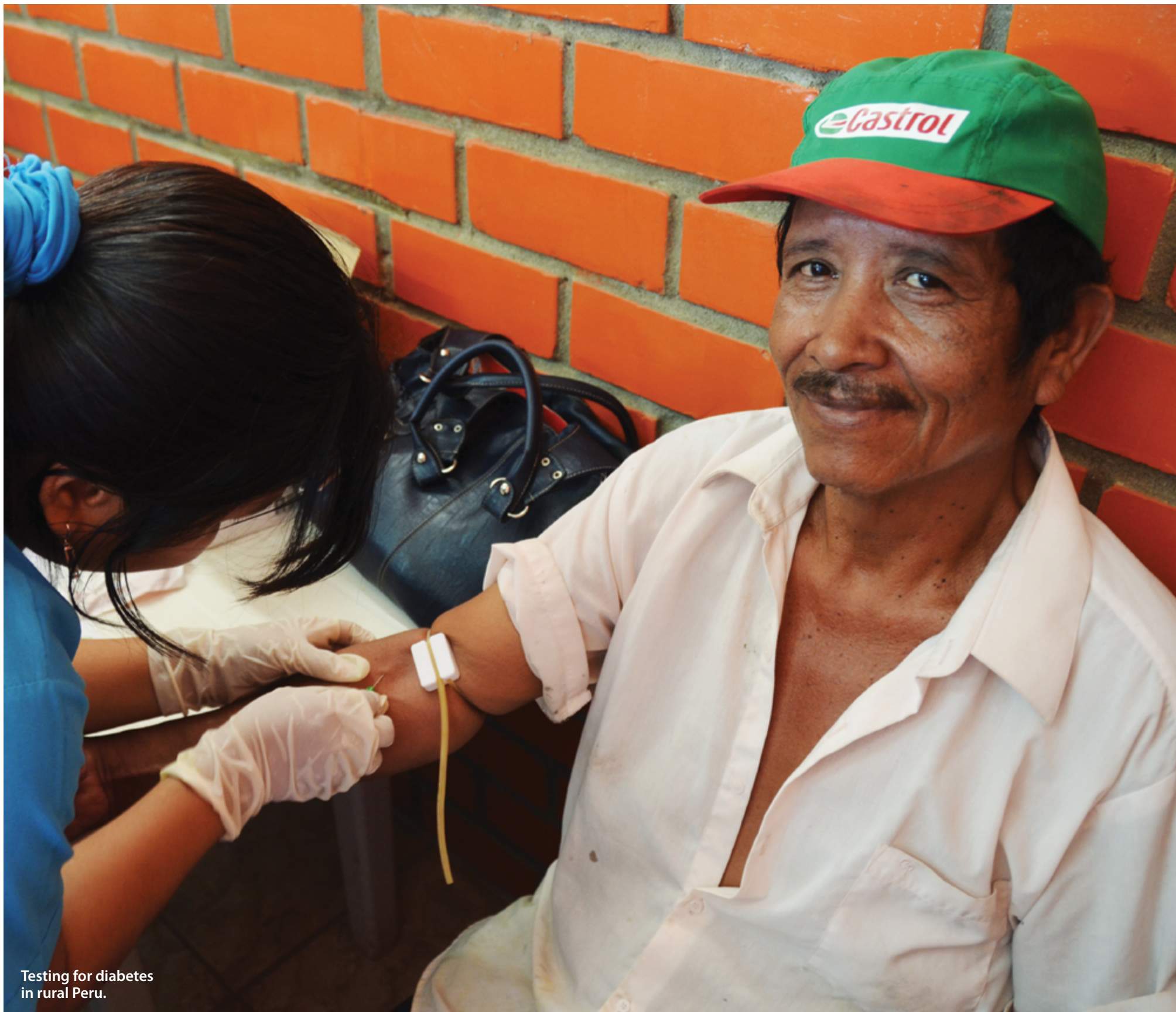
Testing for diabetes in rural Peru.