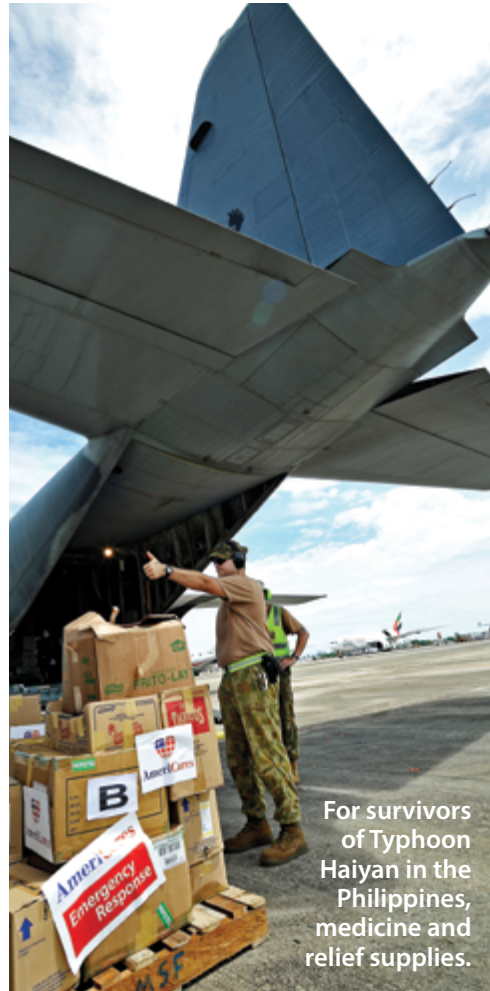
For survivors of Typhoon Haiyan in the Philippines, medicine and relief supplies.

$1.4 MILLION FOR REBUILDING AND STRENGTHENING HEALTH SYSTEMS