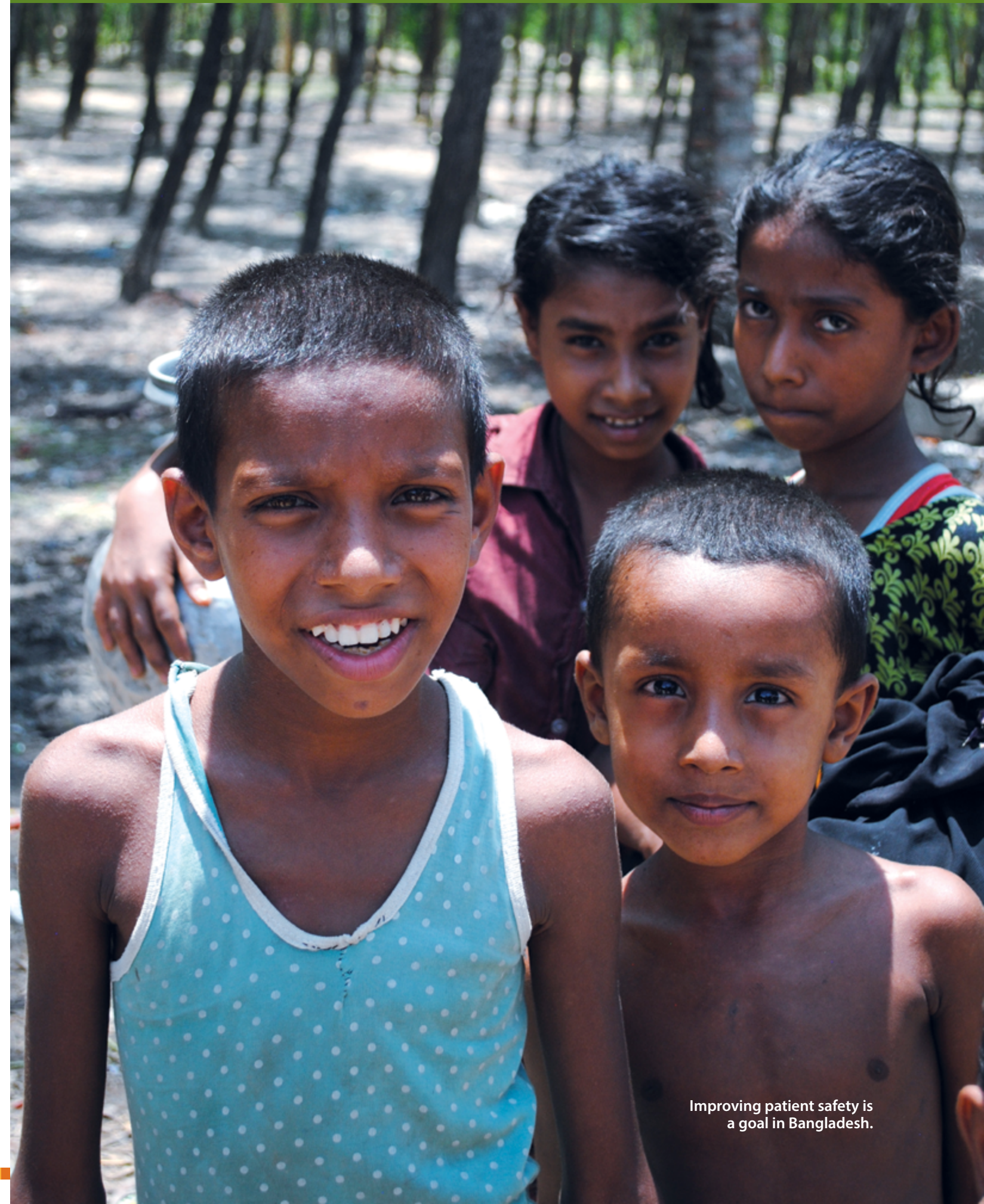
Improving patient safety is a goal in Bangladesh.

taking prescription medicine in Bangladesh, AmeriCares collaborated with GSK and local health organizations to train pharmacy clerks in Mymensingh. With our training, pharmacy clerks at one hospital now have the knowledge to safely dispense medicine, including providing patients with information on completing their treatment—a crucial instruction in low-resource countries where improper use of antibiotics leads to antibiotic-resistant infections. The pharmacy clerks are trained to pass the knowledge to others, creating a culture of safety and responsibility.