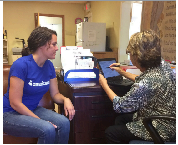
In the United States, AmeriCares close collaboration with local partners allowed us to immediately distribute relief supplies.

AmeriCares provided more than $600,000 in aid to families affected by Hurricane Matthew in the southeastern U.S. Our relief supplies included bottled water, hygiene kits and chronic disease medicine for survivors forced to flee without their medications.